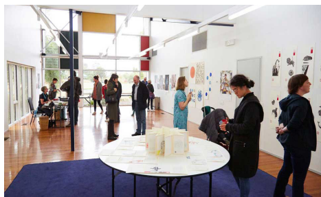
The Studio at Darebin Arts Centre

The DAC Studio is an inviting 6.75 m x 15.7m space with polished floorboards and plenty of natural lighting. This room is available beyond business hours (8am to 11pm, Monday to Sunday, excluding public holidays).