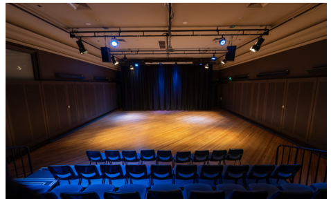
A studio at Northcote Town Hall Arts Centre.

NTHAC Meeting Rooms in the East Wing have carpeted floors and plenty of natural light. These rooms are available beyond business hours (8am to 11pm, Monday to Sunday, excluding public holidays).