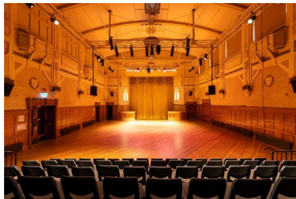
Image: A large art deco hall with seating area in the front.

When the performers are ready, the ushers will announce that the 'house is open'. They will open the doors to the Main Hall, and you may enter at your own pace.