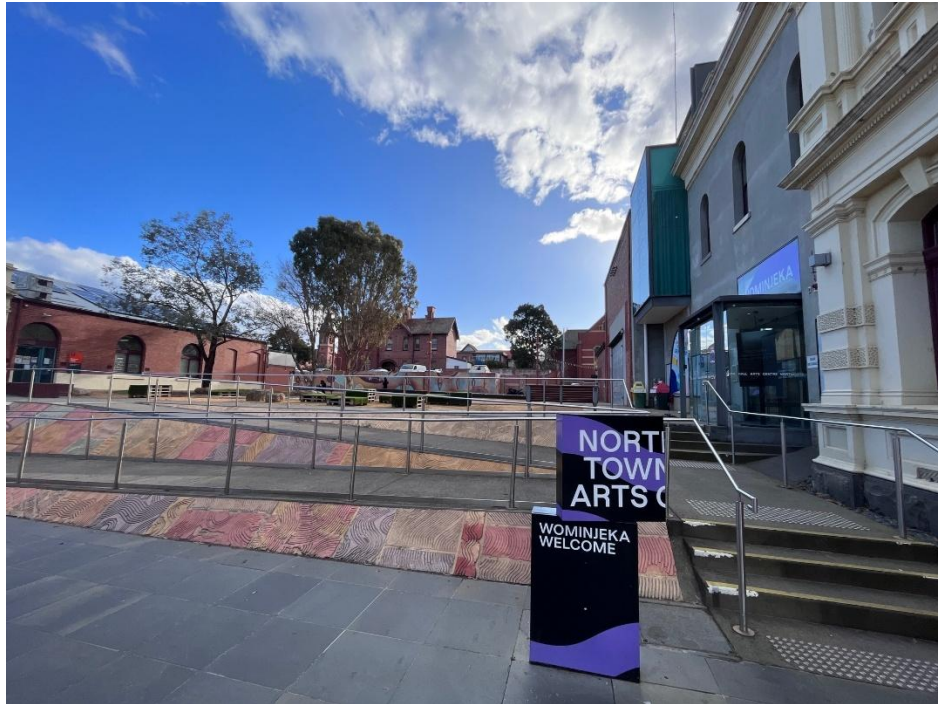
Image: Northcote Town Hall Arts Centre's Civic Square from High Street. The main entrance to the building is the glass door frame on the right.

A Smoking Ceremony will take place before the performance on 13 September and at the conclusion of the performance on 21 September . The Ceremony will take place outside in the Northcote Town Hall Arts Centre's Civic Square. Front of house staff will direct people out the main entrance door to the Civic Square at the commencement of the Ceremony.