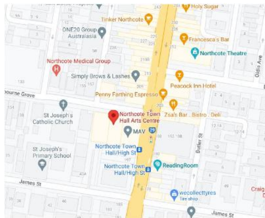
Image: a map of Northcote Town Hall Arts Centre and its surrounding area. Map