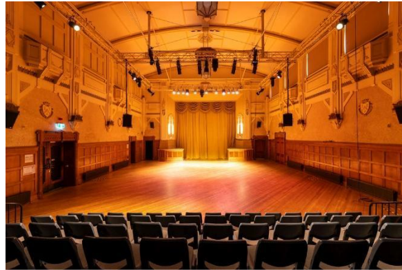
Image: A large art deco hall with seating area in the front.

They will open the doors to the Main Hall, and you may enter at your own pace.