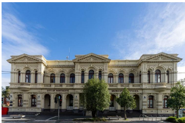
Image: Northcote Town Hall Arts Centre as seen from High St, Northcote