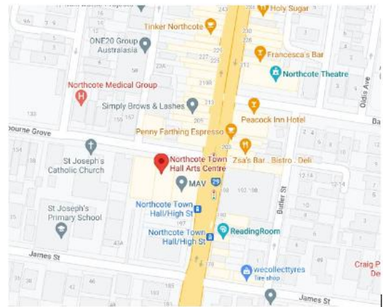
Image: a map of Northcote Town Hall Arts Centre and its surrounding area. Map