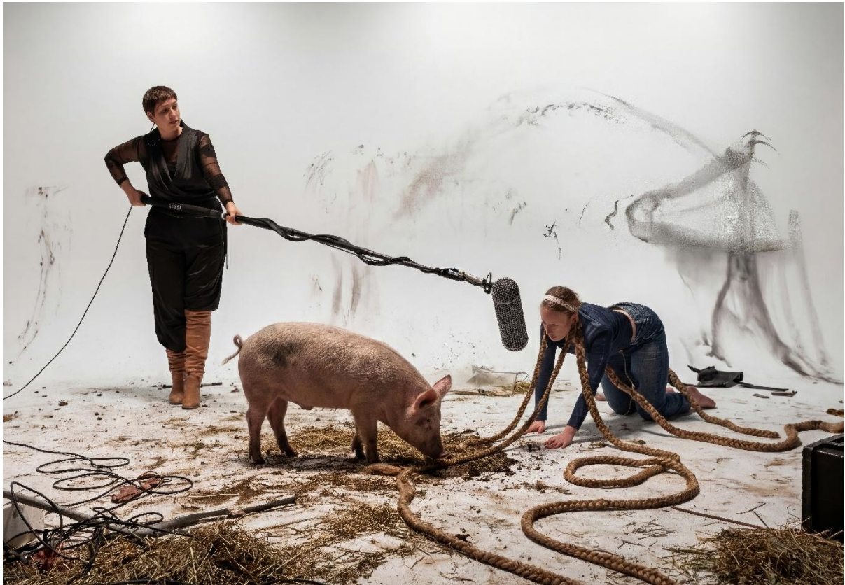
Image credit: Image by Nano Banana Pro in collaboration with Rebecca Jensen. Original image by Sarah Walker ( Slip 2023).

Image description: In a sparse white studio covered in hay and dirt, a pig stands centre, eating from the ground. On the left, a person wearing black holds a boom microphone toward the pig. On the right, another person dressed in jeans and a navy long-sleeved top crouches low, their long-braided hair trailing across the floor like the black coiled cables around them.