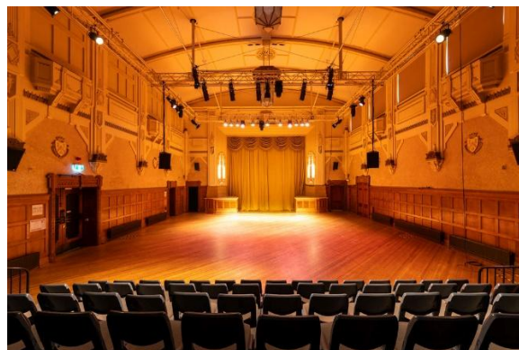
Image: A large art deco hall with seating area in the front.

When the performers are ready, the ushers will announce that the 'house is open'. They will open the doors to the Main Hall, and you may enter at your own pace.