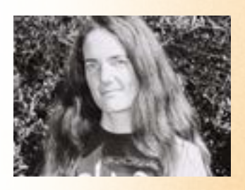
is a composer living on Djadja Wurrung country. Her tastes run from renaissance to rave which she enjoyed exploring the scope of for Apocrypha .

Her simple pleasures are sunshine, bodies of water and bugs.