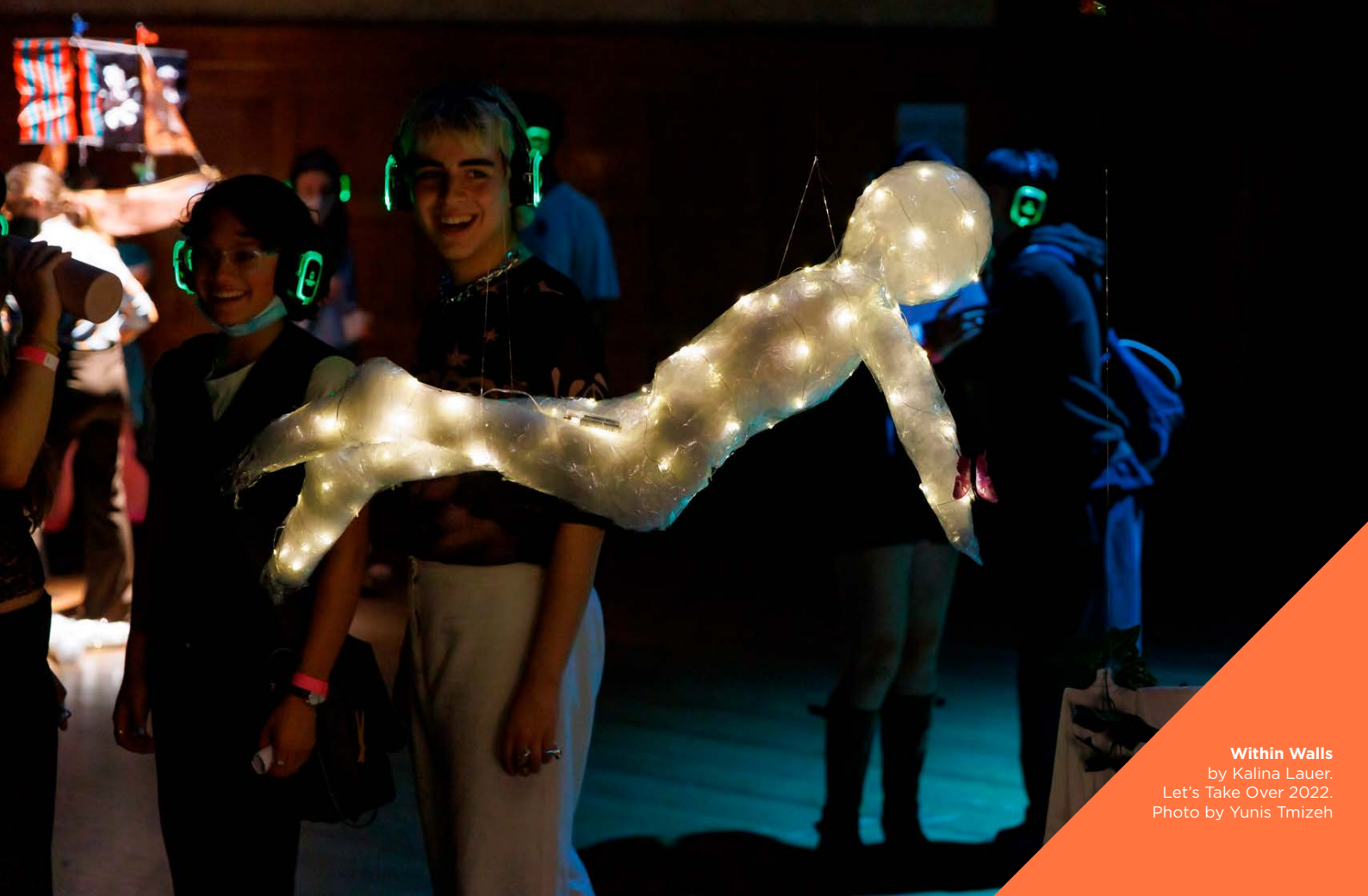
Within Walls by Kalina Lauer. Let's Take Over 2022.